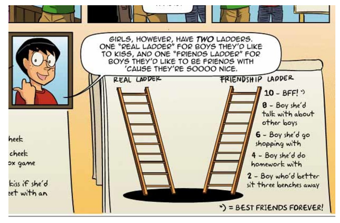
Sample Picture 3

In this study, this meme was found to be the most conflicting as only around half of the total participants found this image to be exhibiting sexist ideologies. Only about 46.75% of the participants found this meme to be sexist, meanwhile 24.9% participants disagreed. 28.3% of participants responded with "maybe". It should be noted that a large number of participants who disagreed were men. This image is highly subjective as it can be interpreted as a mockery of how today generation views relationships but then again it can be said that this is plain generalization of women. This image arose amidst the massive debate of "friend zoning", wherein a boy or girl relegates a person who is interested in them romantically as just a friend. Since a large amount of internet humor is created by men, this image only addresses problems from their point of view. A participant pointed it out, by stating that even if the genders are switched the meme remains the same with no change in its meaning whatsoever. This meme has been seen before by 10.6% of the total participants. It was also one the most shareable memes in this study as over 28.1% of the participants considered sharing this meme through their social media. A participant pointed out that "In socio-cultural terms, it is a very restricted example".