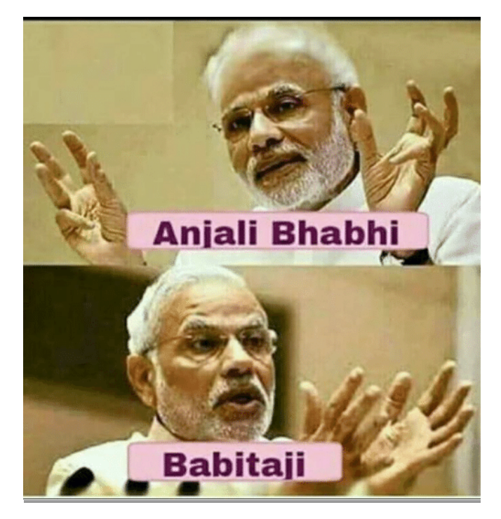
Sample Picture 2